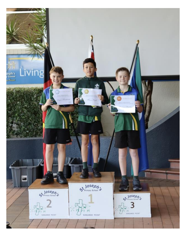
8 - 12 Years Boys (2011)