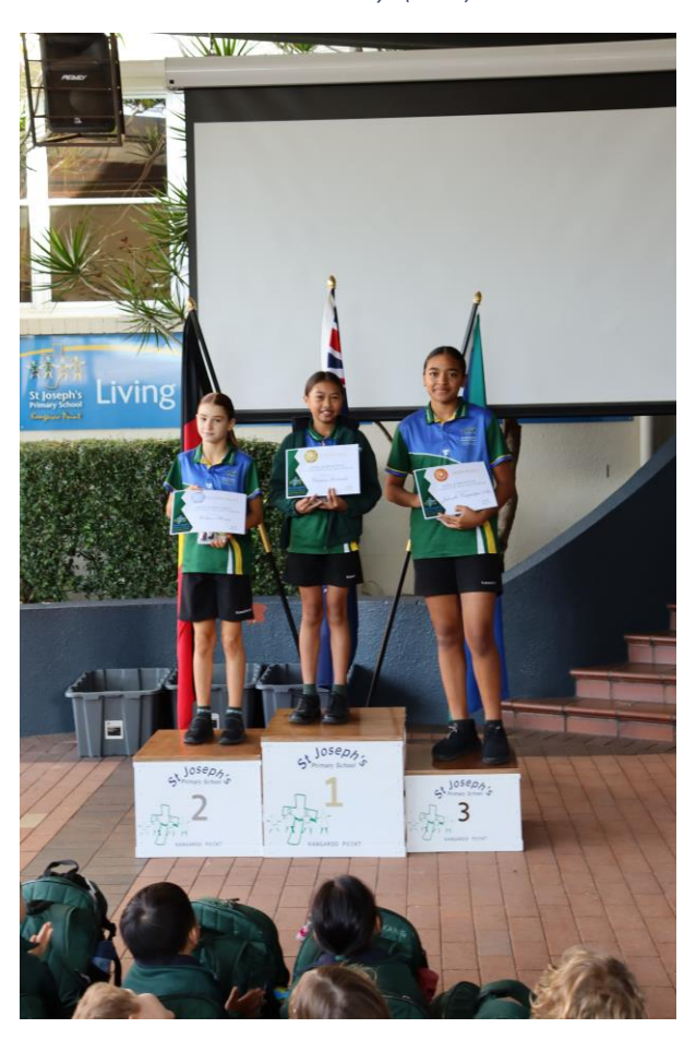
5 - 11 Years Girls (2012)