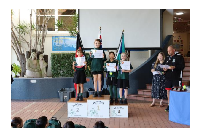
1 - 9 Years Girls (2014)