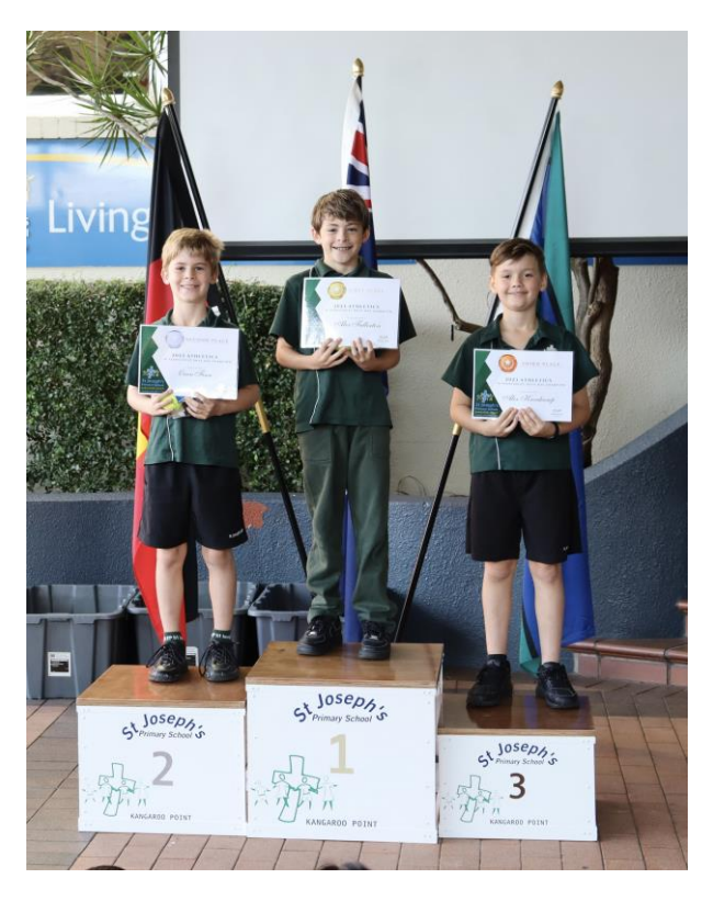
4 - 10 Years Boys (2013)