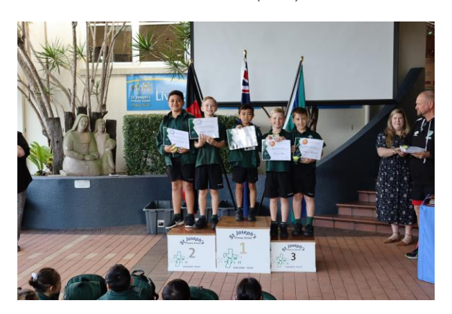
2 - 9 Years Boys (2014)