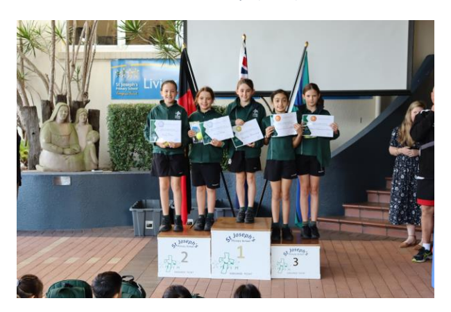
3 - 10 Years Girls (2013)