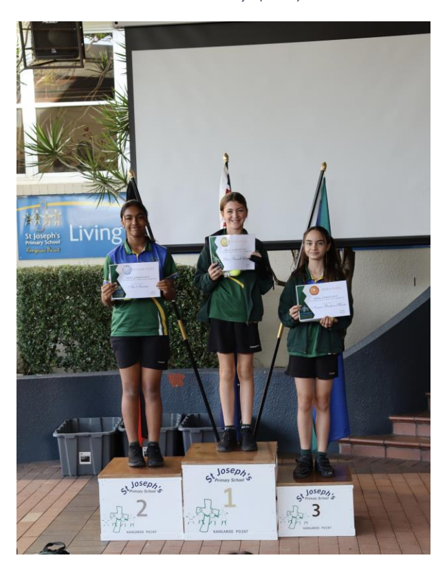
7 - 12 Years Girls (2011)